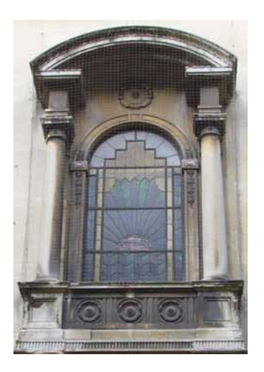
Art-deco style window on The New Theatre

Theatre was a perennially popular entertainment for all classes and theatres were regularly packed to capacity. There had been a series of devastating and fatal fires in theatres across the country caused mainly by gas lighting, inadequate ventilation and mass overcrowding.