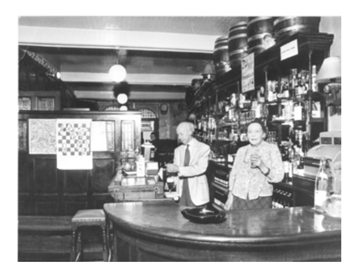
Interior of The Grapes (1969)

Like the Royal Blenheim which we saw earlier, this was one of a new wave of pubs being built towards the end of the nineteenth century. As here, many were designed in an exuberant style to appeal to the working classes, and featured terracotta, tiles, mirrors and cut glass.