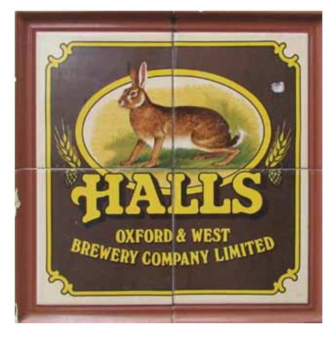
Advertisement for Halls brewery

On this walk we're going to look at how rational recreation manifested itself in Oxford, and also look at some of the less 'self-improving' establishments where working people continued to spend their free time none-the-less. You'll also learn about the growing commercialisation of leisure during this period as businessmen and entrepreneurs found new ways to help workers part with their spare money.