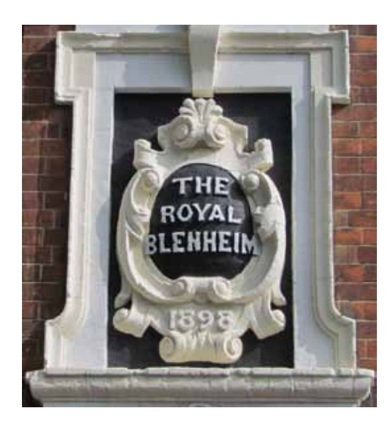
The Royal Blenheim sign

Despite the efforts of the rational recreationists who tried to provide improving alternatives, a great deal of working-class leisure took place in the pub. More than just a place to consume alcohol, pubs traditionally played a strategic role in the organisation of working class culture and politics providing venues for discussion and debate and for meetings of Friendly Societies and other groups; some even housed working men's libraries.