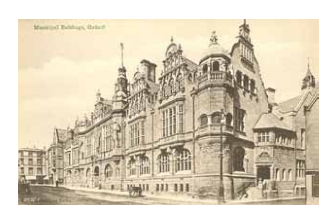
The Arts and Crafts style Town Hall and Public Library

Lending or 'circulating' libraries had become increasingly common in the 1830s and 40s. They were normally privately run (for profit) and temporary, perhaps only lasting a few months. The Public Libraries Act of 1850 allowed large towns like Oxford to establish public libraries for the first time and, importantly, to finance them through local rates. Oxford's first was on this site in 1854 in the old Town Hall.