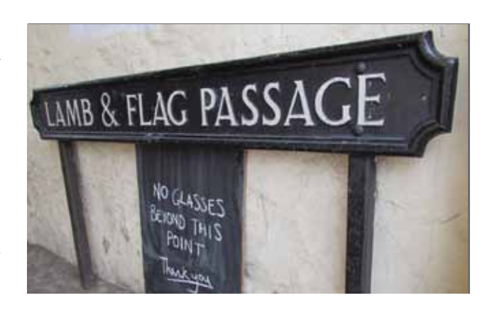
A popular drinking spot

I take quite a lot of groups on walking tours to look at lesser-known aspects of the city's history and it's always great to show people places which they've never noticed before, even if they've lived in Oxford for years, and to explain some of their history.