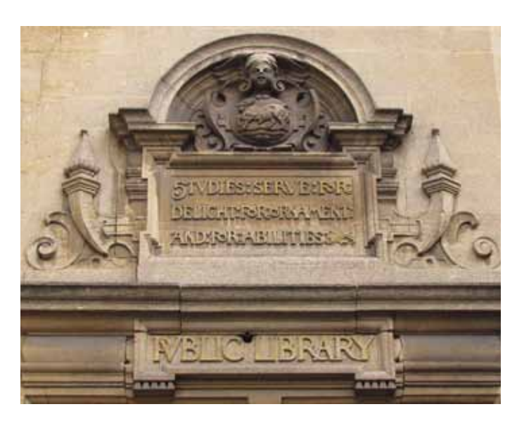
'Studies serve' carved in stone over the library entrance

Several civic buildings have stood on this site over Oxford's history. A guildhall (a meeting place for craftsmen like textile workers and masons was first built on this site in 1292. It was replaced in 1752 by a Town Hall which itself was demolished in 1893 to make way for this current building, the new Town Hall. Both the old and new Town Halls included large spaces for public meetings and concerts.