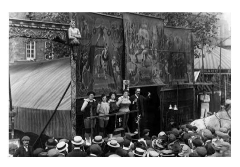
Female wrestlers at St Giles' fair (1909)

St Giles' Fair still happens today. For two days in September the whole of this road is closed off and the fair takes over the whole street. Unlike St Clements Fair to the east of the city, St Giles was not a hiring fair where people went to find work but developed from the seventeenth-century St Giles parish wake.