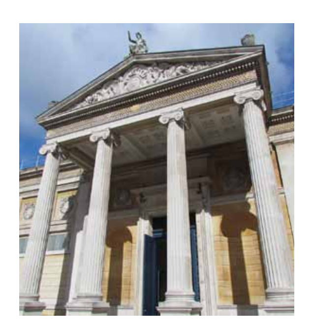
The Ashmolean Museum portico

In the mid-nineteenth century the industrial revolution swept across Britain. As farm workers deserted the countryside for new jobs in towns and cities, places like Oxford were transformed. New urban lifestyles meant more money and more free time. For the first time working people discovered the concept of leisure. Pubs, theatres, music halls, travelling fairs and other 'low brow' entertainments boomed. But the middle classes had other ideas. Leisure should not only be respectable but also productive – good both for the soul and the country.