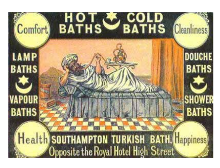
Advertisement for Southampton Turkish Baths (1878)

Working Men's Clubs were increasingly popular in the Victorian period. They aimed to provide a place other than the pub where working men could meet and discuss subjects of interest with like-minded companions. Many played an educational role - they often had libraries and organised improving lectures on topics thought suitable for the working classes like science, geography and foreign culture.