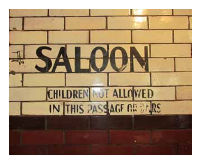
Directions to the saloon still visible in The Grapes pub

There was an ongoing struggle between those who sought to control how the working class spent their leisure time - the Temperance movement, the church and the rational recreationists - and those who tried to encourage them to spend their time and money in pubs, at the theatre and at St Giles' Fair.