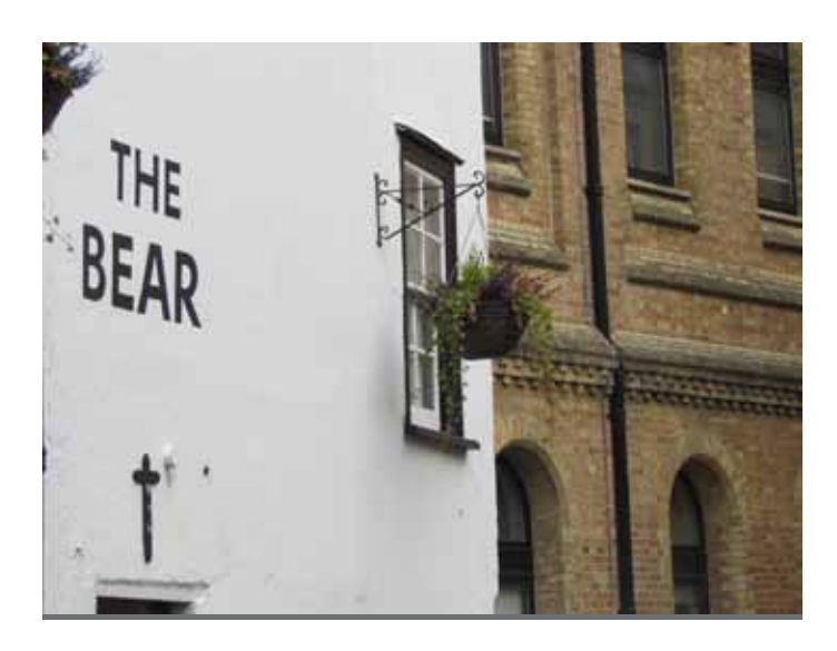
The Bear Inn stands cheek by jowl with the Oxford Gymnasium

Improved transport also meant that people wasted less time travelling to and from work so had more time for themselves. These factors, together with a rise in wages, meant that for the first time, working people found themselves with free time and spare money. Not surprisingly, after a long, hard day in factories, shops and offices most workers chose to spend their time off relaxing and socialising in places like the pub.