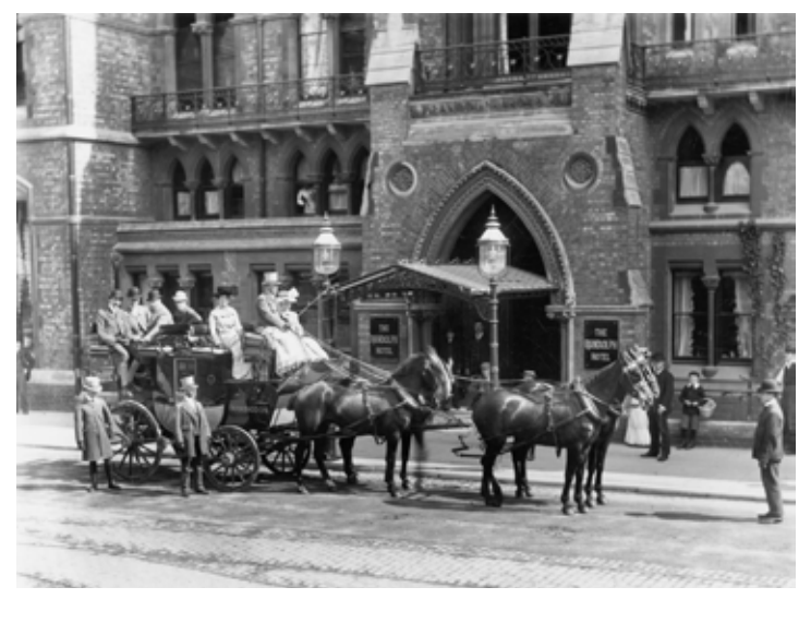
The Randolph Hotel entrance (1890)

The Randolph was a new type of hotel for Oxford. It was one of the first purpose built hotels. It's large, luxurious, on a grand scale and built with 68 rooms for guests.