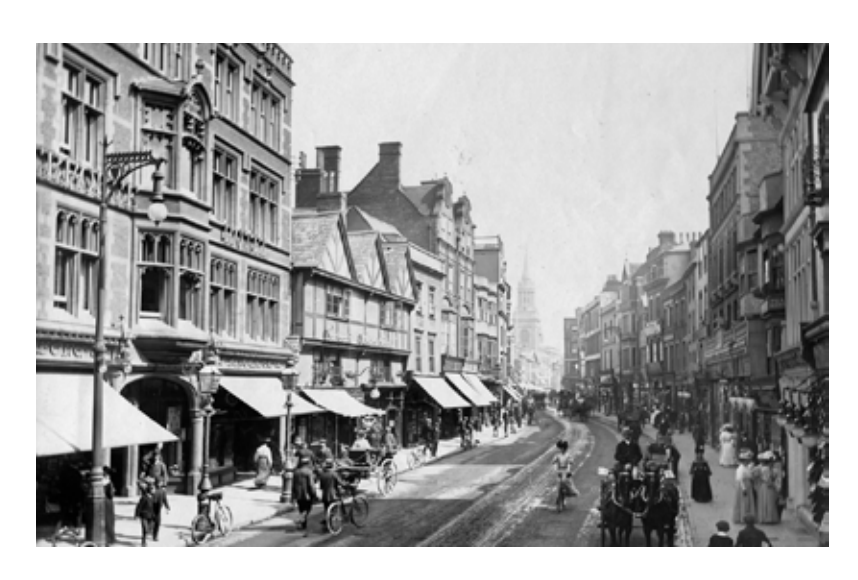
The Wilberforce Temperance Hotel (c.1900)

The Temperance movement grew out of middle class concerns about how the working classes were spending their free time.