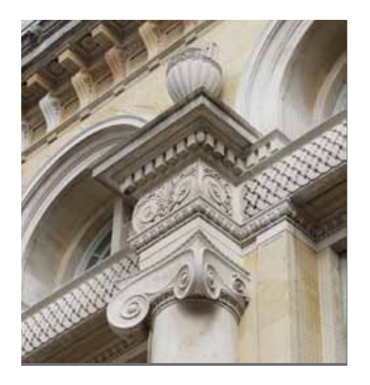
Grecian frieze on the Ashmolean Museum

The architect of the building was Charles Cockerell and it was described by the architectural historian Geoffrey Tyack as Oxford's finest building of the first half of the 19th century. As you can see it combines styles from a range of European classical traditions. Look up and you can see the plaited freeze along the top of the building which is Grecian. The rounded archways over the columns in the side wings of the building are Roman.