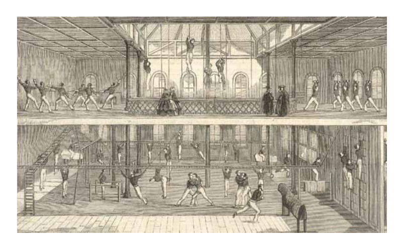
Interior of the Oxford Gymnasium