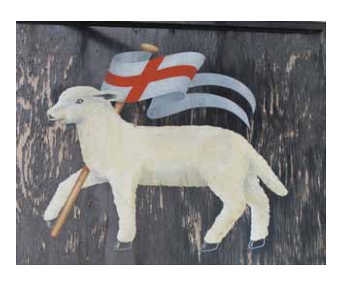
The Lamb and Flag pub on St Giles

Bank holidays were introduced in 1871, the word "weekend" came into use in 1879 and from 1896, Oxford's shop workers could enjoy an early closing day.