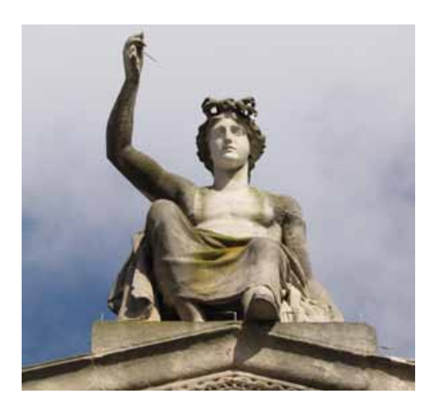
Figure atop the Ashmolean Museum

Donations from two well-known philanthropists, Rev Dr Francis Randolph and Sir Roger Newdigate, enabled the building of the Ashmolean Museum. Its opening in 1845 coincided with the Museums Act which paved the way for the establishment of free public museums across the country. As a result museums became increasingly popular and the Ashmolean became a well-loved weekend destination for Oxford citizens from all walks of life.